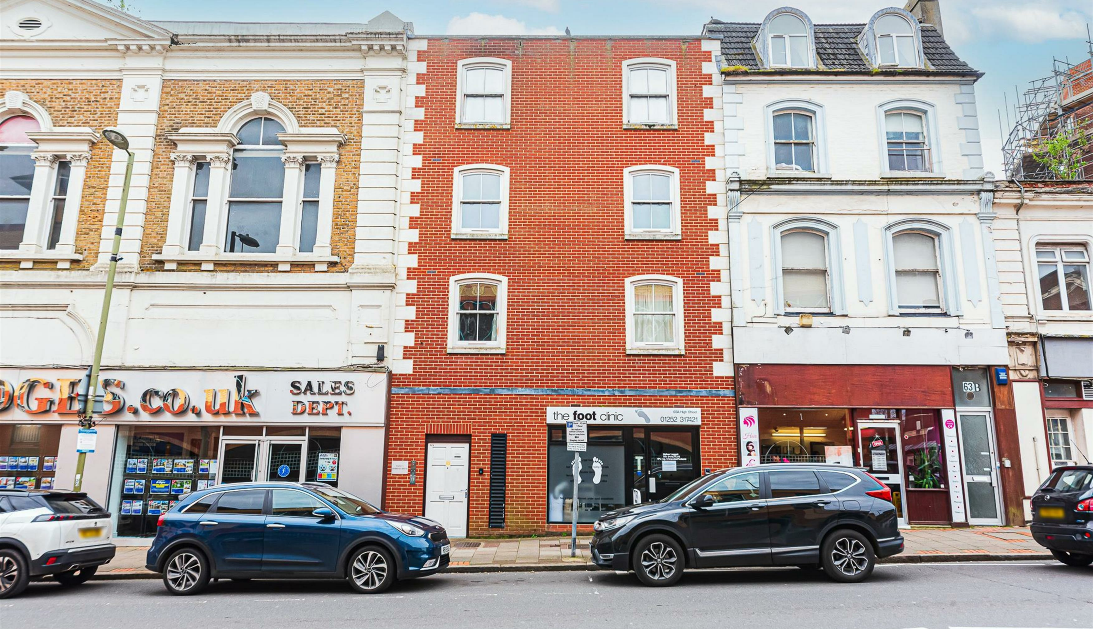
Sparkhall House 65 High Street, Aldershot